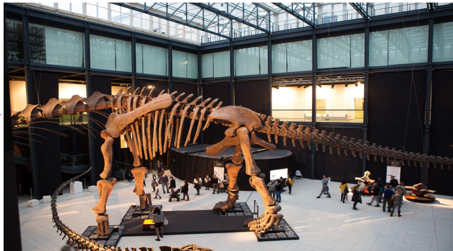
Dinosaur bones found in Argentina

Where have the most dinosaur fossils been found?