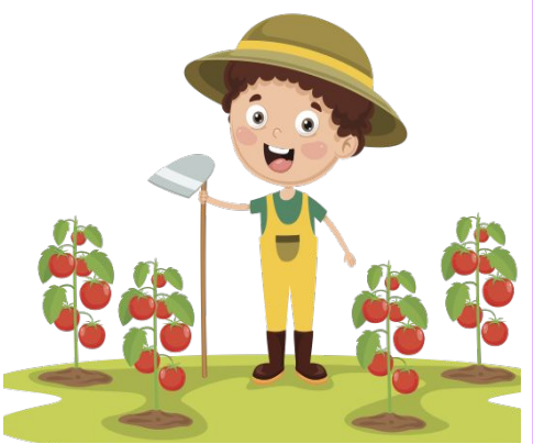
c) tomato farm

Maggie woke up and looked outside the window. It was a bright and beautiful day for a picnic. She was excited and _____