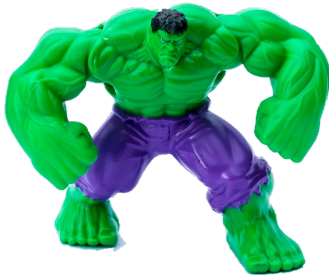
h u l k