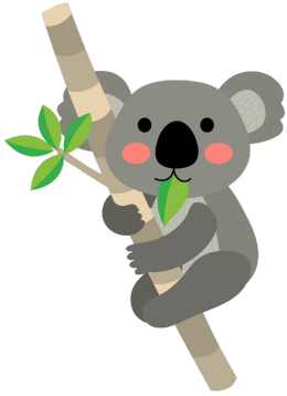
k o a l a

Circle each letter k in the words given below.