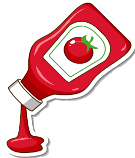
k e t c h u p