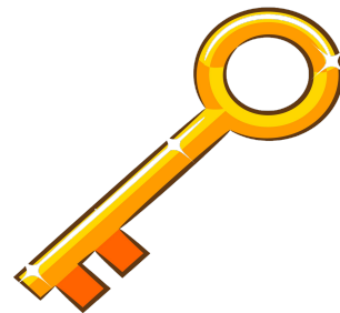
k e y