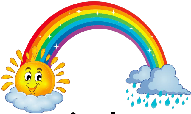
r a i n b o w

Circle each letter r in the words given below.