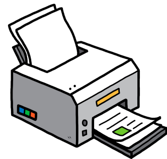
p r i n t e r