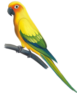
p a r r o t