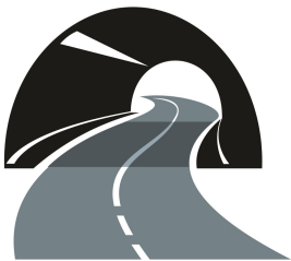
r o a d